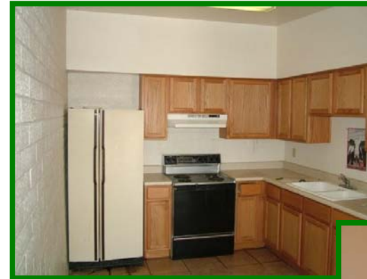
Vaulted Ceilings Throughout

Great location in Tempe! Easy access to Loop 202, ASU, Tempe Town Lake/Beach Park and all that Tempe has to offer! Great unit mix! Tile throughout for low maintenance costs – stucco exterior and lots of storage for the tenants. This property was purchased at auction – renovation just completed. Please do not disturb the tenants.